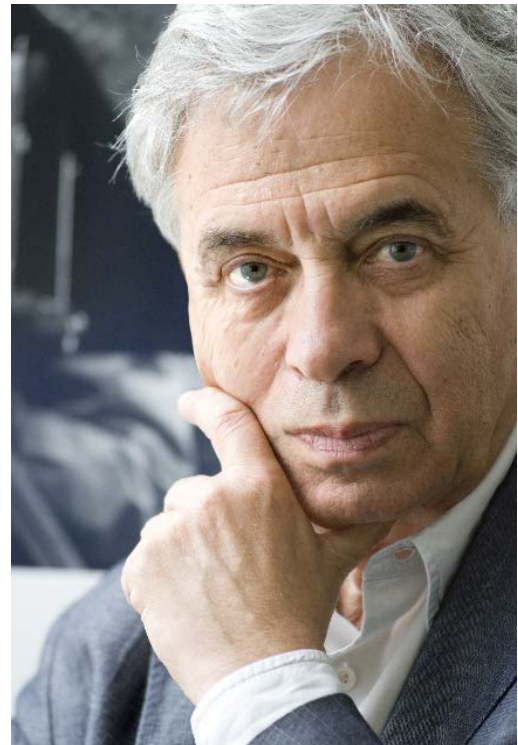
Timm Rautert, 2011